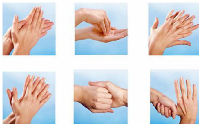
Figure 1 – Steps in hand disinfection according to EN 1500

Good dental practice requires that alcohol-based skin antiseptics be used firstly. They are active within 30 seconds