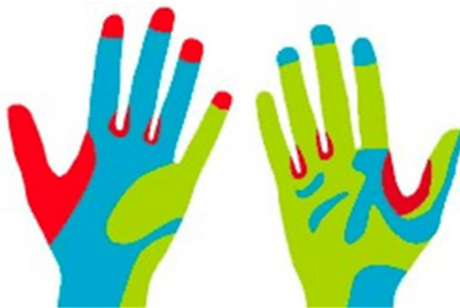
Figure 2 – In red – areas that tend to be worst washed; in blue – areas that get moderately washed; in green – areas that usually get well washed according to data from the World Health Organization (WHO) during routine hand washing (1)

In the period March–April 2019 with a sterile swab with Amies transport medium, the hands of a total of 115 dentists